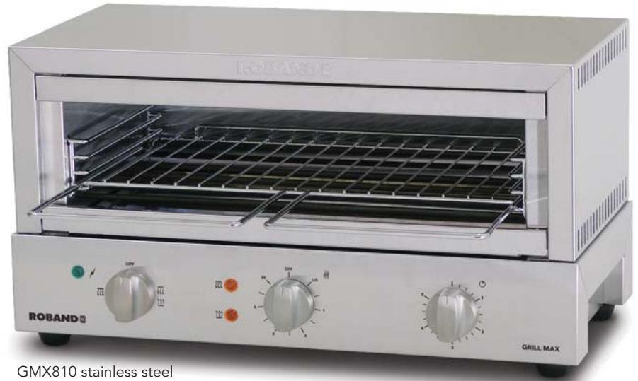
GMX810 stainless steel element toaster pictured

Featuring either stainless steel elements for prolonged element life and good heat retention or glass elements for rapid heat up time. Both types of machine deliver outstanding results and the two options exist to suit customers' preferences.