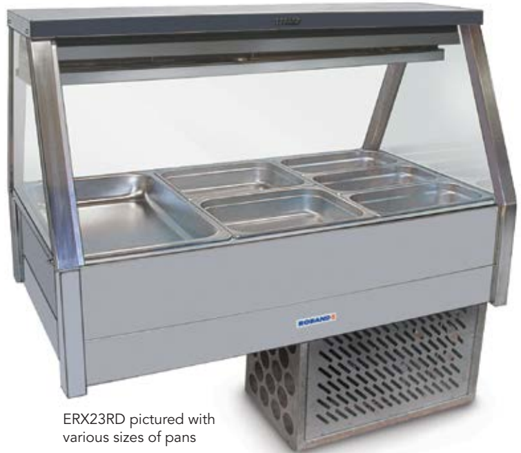
ERX23RD pictured with various sizes of pans

Adjustable digital thermostat, 0 °C to 8 °C