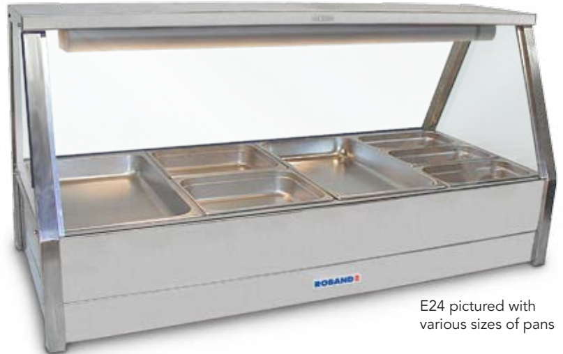
E24 pictured with various sizes of pans

These double row hot food display bars have streamlined styling that will enhance food presentation whilst keeping the food at the correct serving temperature. A wide range of sizes and options are available to cater for numerous combinations of gastronomy pans up to 100 mm deep. Set of 1/2 size 65 mm pans included.