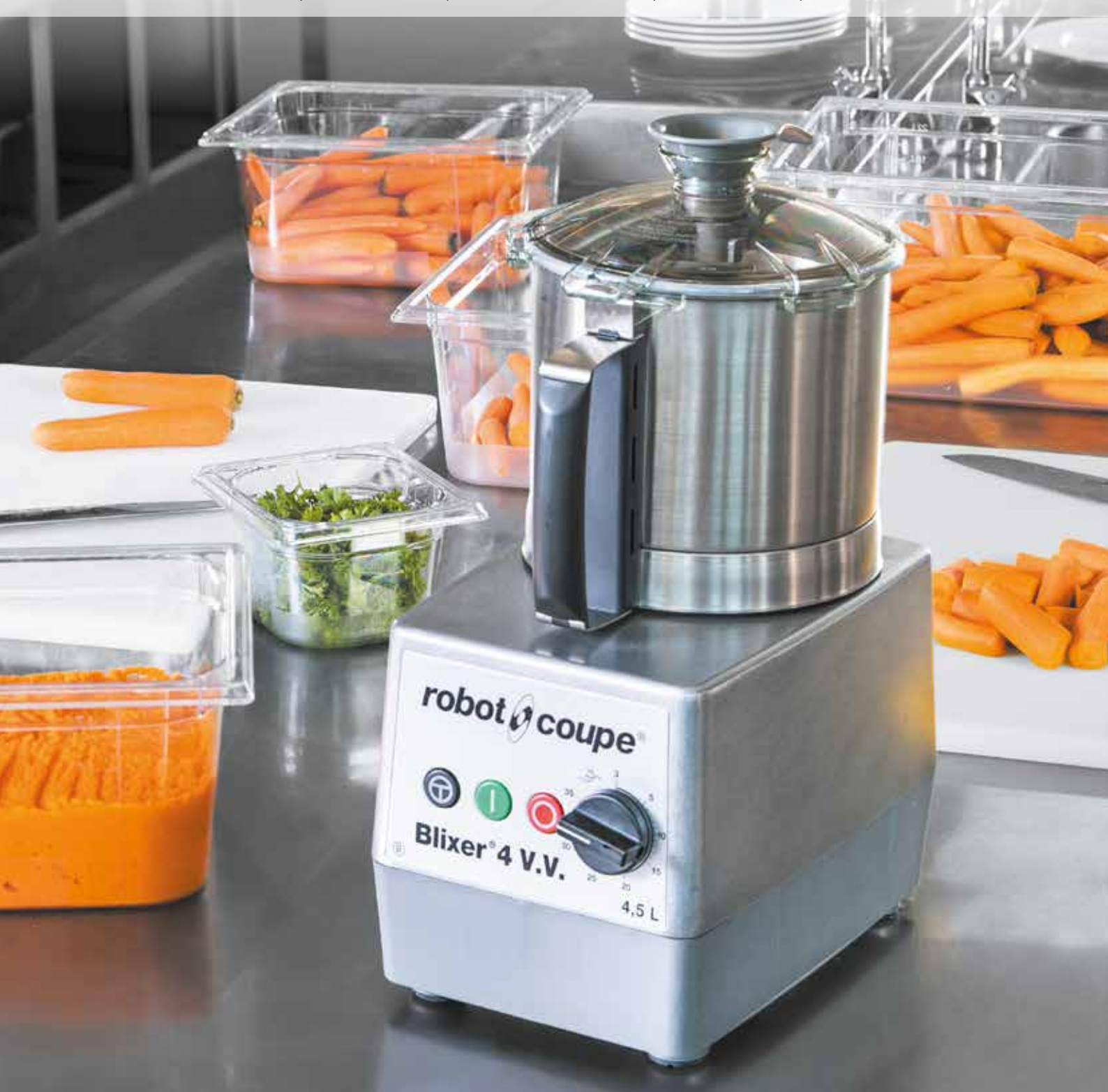
Table-top models: Blixer<sup>®</sup> 2, Blixer<sup>®</sup> 3, Blixer<sup>®</sup> 4, Blixer<sup>®</sup> 4 V.V., Blixer<sup>®</sup> 5, Blixer<sup>®</sup> 5 V.V., Blixer<sup>®</sup> 7, Blixer<sup>®</sup> 7 V.V.

HOSPITALS - NURSING HOMES - CRÈCHES - RESTAURANTS