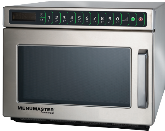
Model DEC18E2 shown