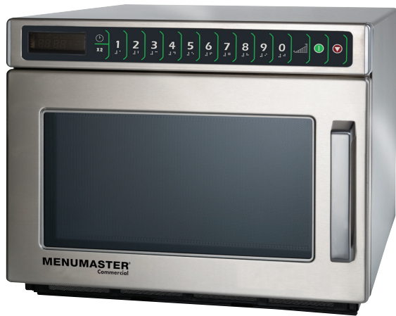
Model DEC14E2 shown