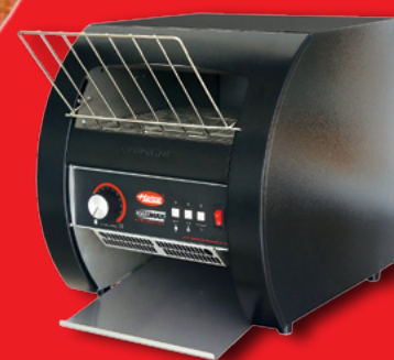
Model TM3-10H in Designer Black Finish