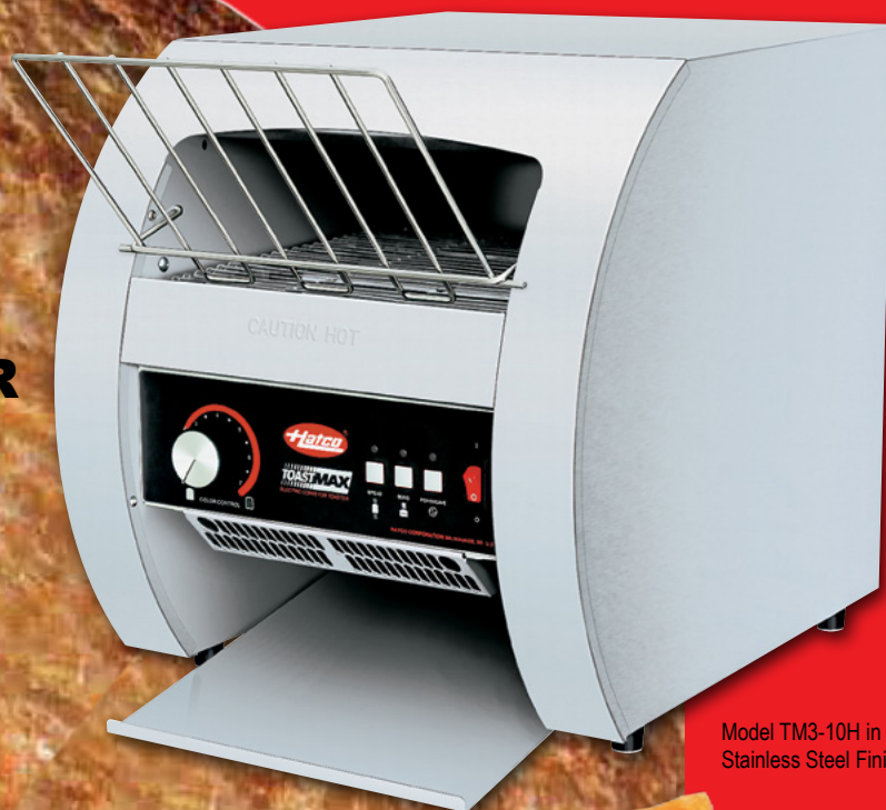
Model TM3-10H in Stainless Steel Finish

Style and consistent high quality output come together in the new TM3-10H Conveyor Toaster with Color Guard™ technology