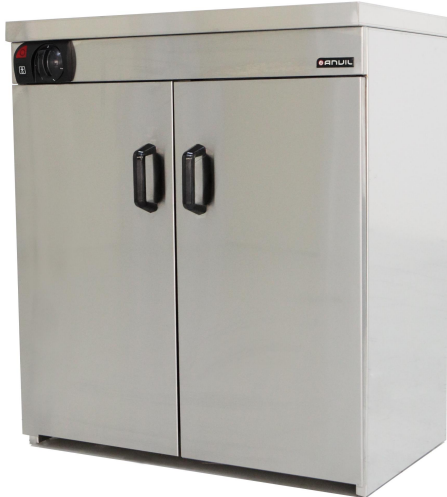
PLATE WARMER DOUBLE DOOR