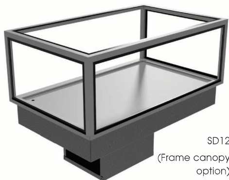
SD12 (Frame canopy option)